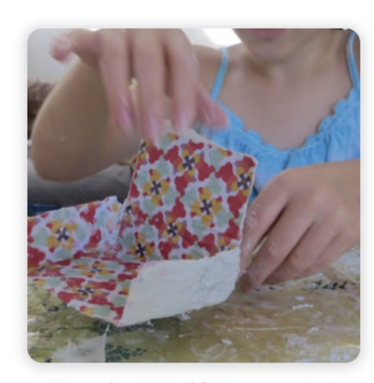
See the "Half" AccessArt Primary Art Curriculum designed for schools alternating Art with other subjects each half term