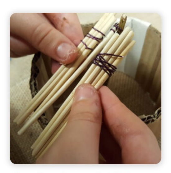
See the AccessArt Primary Art Curriculum designed for schools teaching in mixed year groups