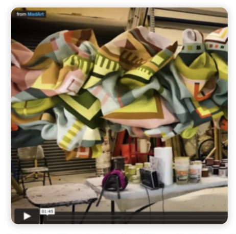
Explore the work of painter / sculptor Marela Zacarías