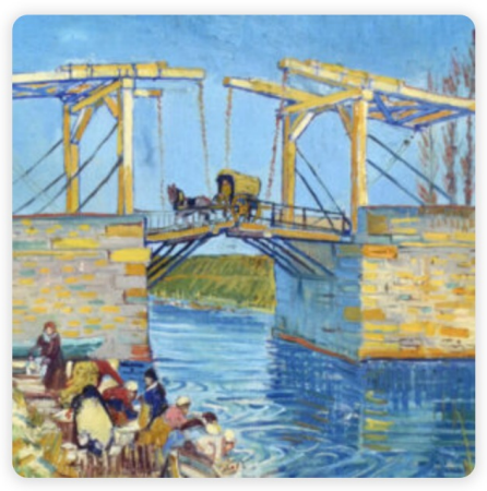
How can imaginative can bridges be?