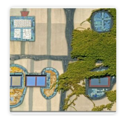
Exploring the architecture of Austrian Architect Hundertwasser