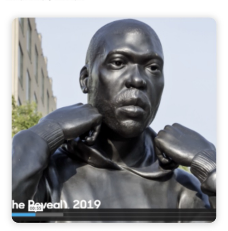
Explore the bronze sculptures made by Thomas J Price