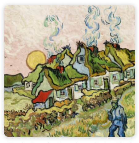
Exploring the brushwork detail of paintings by Van Gogh and Cezanne