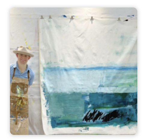
Explore the work of painter Charlie French