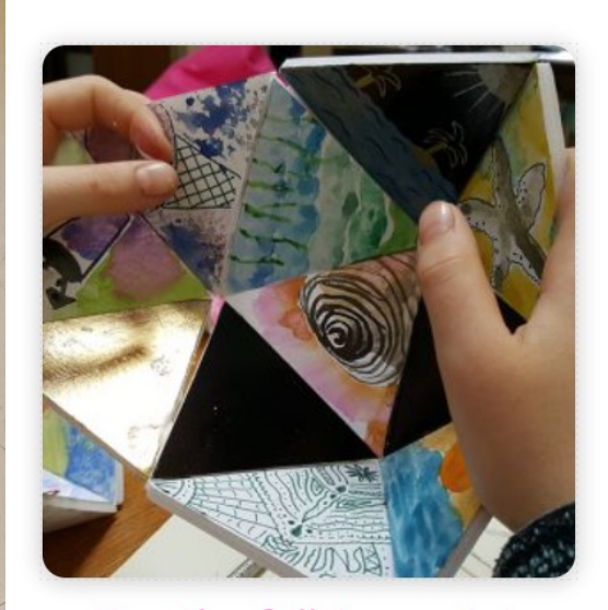
See the full AccessArt Primary Art Curriculum designed for schools teaching art (primarily as a discrete subject) each week