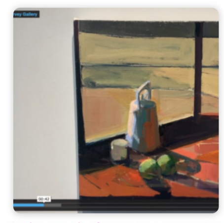
Explore work of contemporary artists working with still life