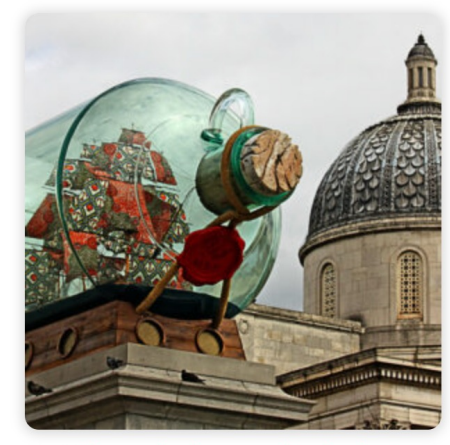
What role does a plinth play?