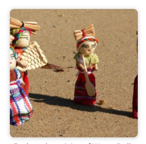
Explore the origins of Worry Dolls