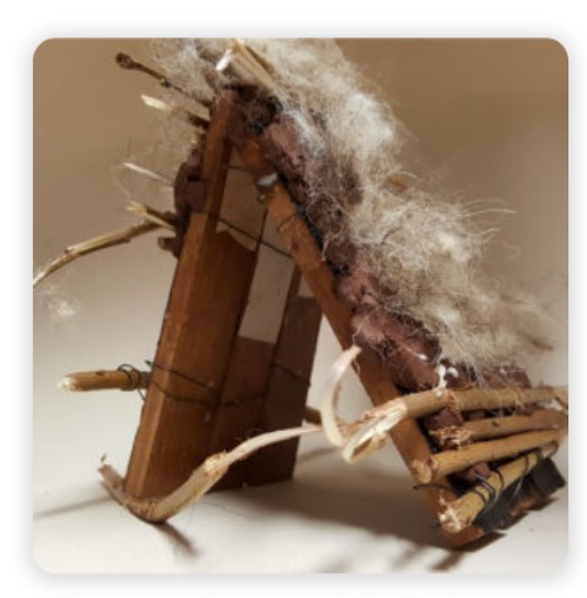
See the AccessArt Primary Art Curriculum designed for schools wanting to link to other Curriculum areas